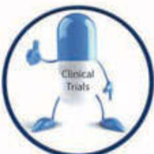
Claim Substantiation through Clinical Trials

Author of >100 scientific publications, Editor of books Has >20 awarded Ph.D. Graduates Creative extraction technology for Botanicals Advanced organic chemistry skills 15 years of proven track record in herbal characterization Global supplier of herbal reference standards 150 man years of scientific expertise