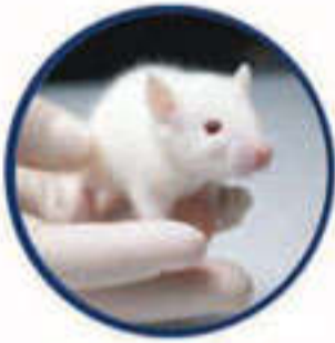
Validating Safety and Efficacy